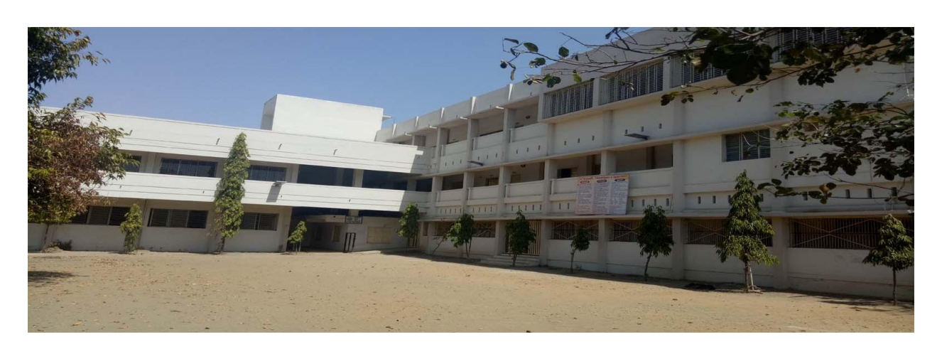
College's huge building