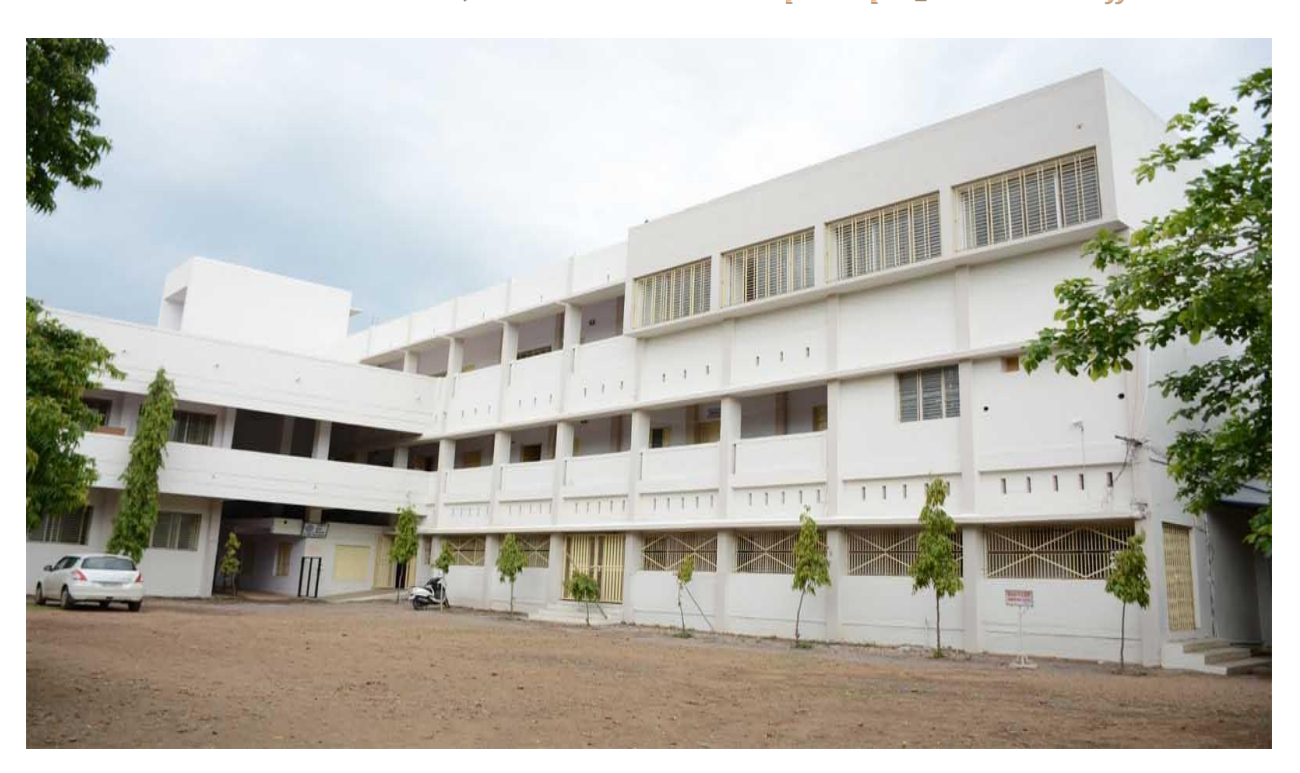
Criterion 4: Infrastructure and Learning Resources 4.1.1

{\it Dist.Wardha, Maharashtra. Email-principal\_acscrv@rediffmail.com}