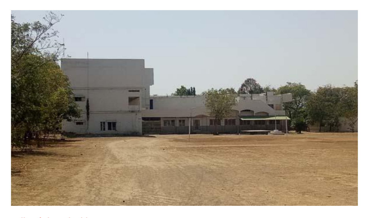
College's huge building