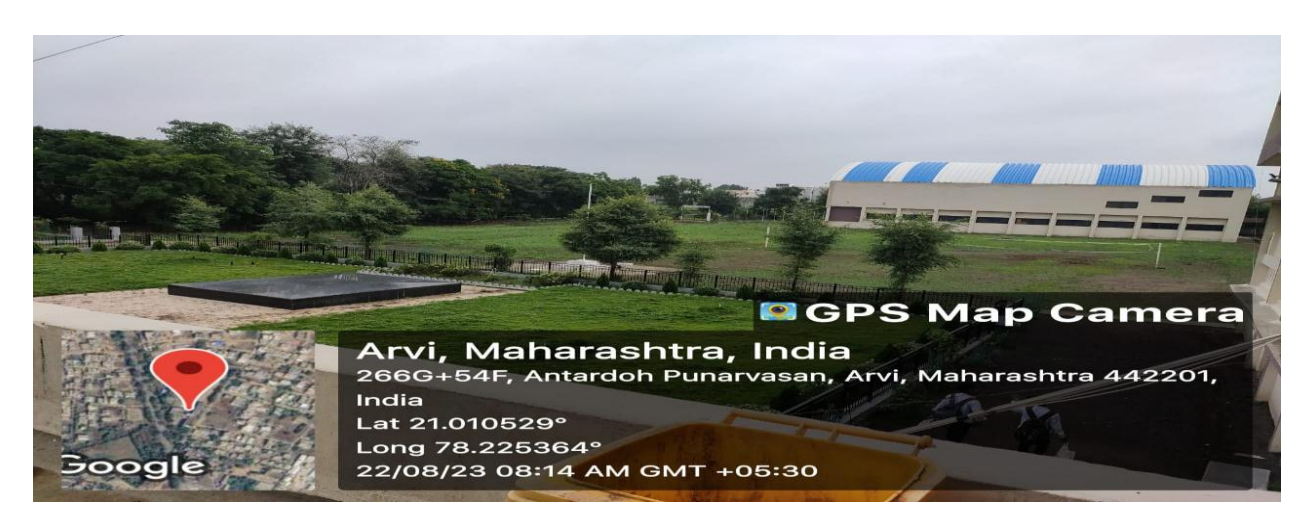
Botanical garden, Ornamental garden and Indoor Stadium